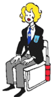
JUDGE NORMAL POSITION