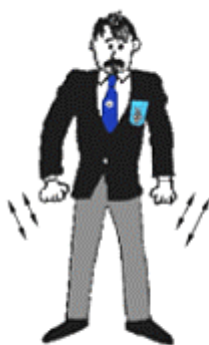
HAJIME ⇔ SORE-MADE