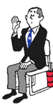
JUDGE'S OPINION DIFFERS