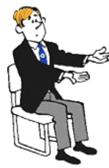
STAND UP MATE IN NEWAZA