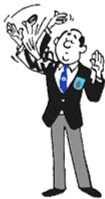
TO CANCEL EXPRESSED OPINION