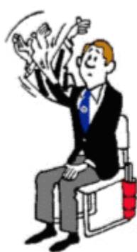
JUDGE CANCELLING NOT VALID