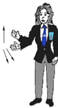
SIT DOWN ⇔ STAND UP