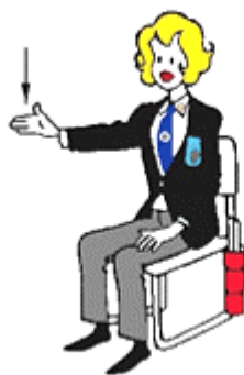
INSIDE ⇔ JONAI