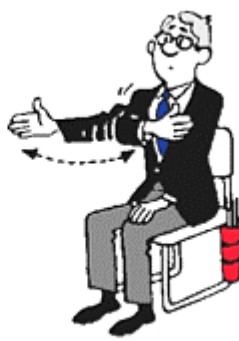
OUTSIDE ⇔ JOGAI